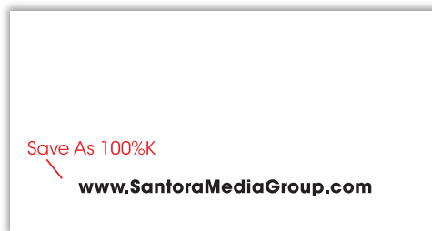
File #2—Art Submitted For Foil Layer