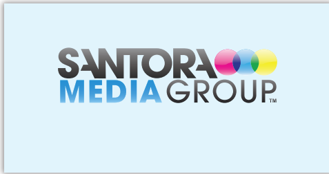
File #1—Art Submitted For Print Layer