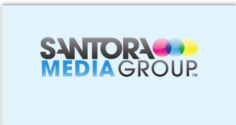
File #1—Art Submitted For Print Layer